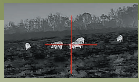
Exceptional Optic Performance The Nighthunter S35 delivers on the darkest of nights with crisp, clear images in a reliable thermal optic.