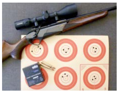
The Benelli Lupo Walnut preferred Sako Super Hammerhead 180-grain loads when tested over the bench.